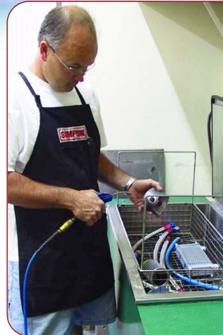
The demands and dirt of offroad racing are no match for Omegasonics.