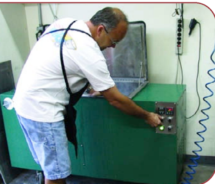
Controls are simple to operate and the actual cleaning is hands-off.