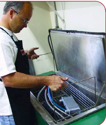
Multiple parts can go into the Omegasonics at the same time.

Adam learned about the benefits of ultrasonic cleaning and began doing research. "I looked into a few manufacturers but I was impressed with Omegasonics' reputation—they stood out," said Adam. "They have a great machine and were real easy to deal with." After a hands-on session with Omegasonics products at a tradeshow, Adam purchased the Omegasonics Super Pro with a 45 gallon capacity and 4000 watts of ultrasonic power. For his cleaning solution, he chose OmegaClean, an Omega Chemistry product that removes oil, carbon, and contaminants from a variety of metals. OmegaClean's buffers protect aluminum finishes and its silicates guard against flash rusting.