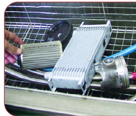
Omegasonics cleans a wide array of parts, including pistons, coolers and oil lines.