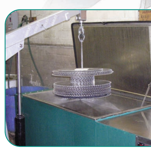
Dirty blades go into the Omegasonics PowerPro 6000, still carefully stacked as they were during transport to the shop.