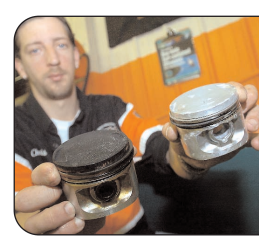
Before and After: Pistons go into the Omegasonics Pro Plus dark and dirty and come out immaculate.