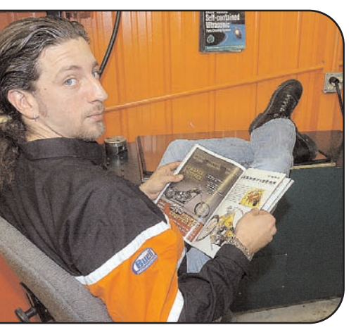
Omegasonics gives "hands off" cleaning a whole new meaning.

Once back in Maryland, the All American team began testing different parts in the Omegasonics Pro Plus to make sure the machine was "Harley friendly." Christian knew that raw aluminum and clear coat aluminum were very sensitive to chemicals. Likewise, a chemical misstep with powdercoat finishes would separate the coating from the part. Then there were steel cams, crankshafts and multiple pieces made from Harley-Davidson's signature chrome-plated metal. In the end, Omegasonics proved compatible and safe with every selected part.