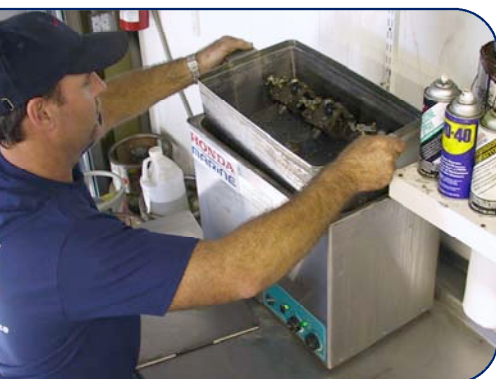
Multiple carburetors can be cleaned at the same time with the Omegasonics 4775.