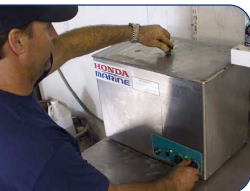
Set it, forget it, and do something else while the Omegasonics 4775 does the cleaning work.